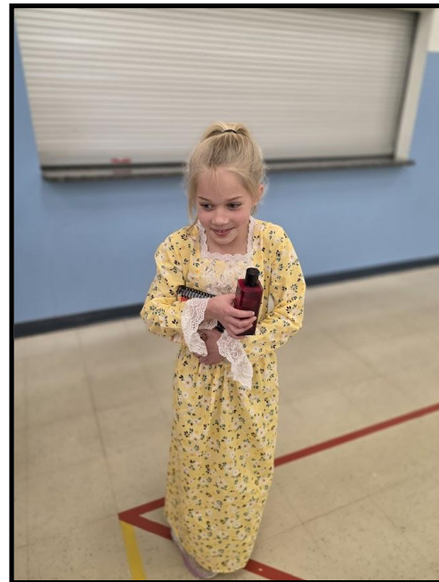
Mary of Bethany AKA Avonlea